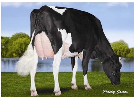
RANSOM RAIL FACEBOOK PARIS