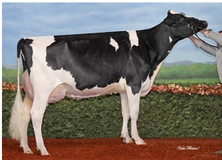
FIELDHOLME FACEBOOK FARRAH

CONFORMATION 1321 Herds 2646 Dtrs 98% Rel