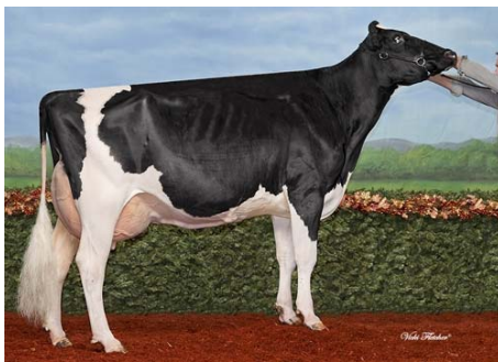
RMW FACEBOOK ASHLEY